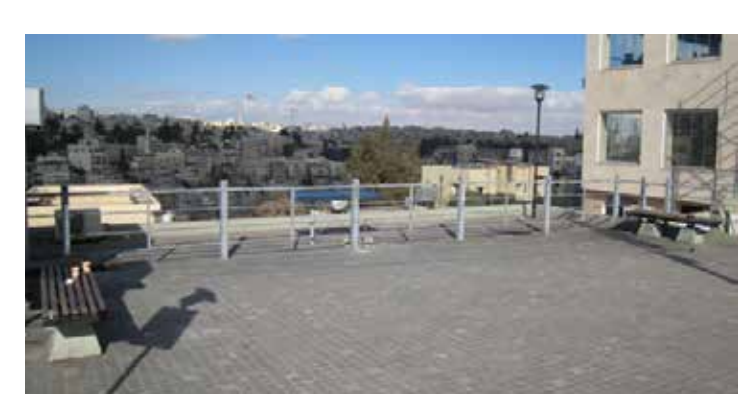
Figure 3: A scenic lookout on Rainbow Street

Rainbow Street is a space where the Arab street and notions of cosmopolitanism collide. Asef Bayat, a sociologist who examines urban space and politics in the Middle East, calls the street in the Arab world the "chief locus of politics for ordinary people, those who are structurally absent from positions of power." Rainbow Street is a space for ordinary Ammanis, who are structurally absent from neoliberal projects and elite, cosmopolitan consumption patterns. As a public street, it is a place for Ammanis of all socioeconomic backgrounds: the Sudanese shabab (unmarried young men) who hold rap battles at night, the Circassians who host break dancing competitions, the group of guitarists who gather nightly, the neighborhood children who race on their skates and dash through the long line of cars, the Syrian refugees who wait outside the Saudi Arabian consulate for visas, the employees who sit on the street during their cigarette breaks, the shabab who tease the American man who exercises on the street, and the families