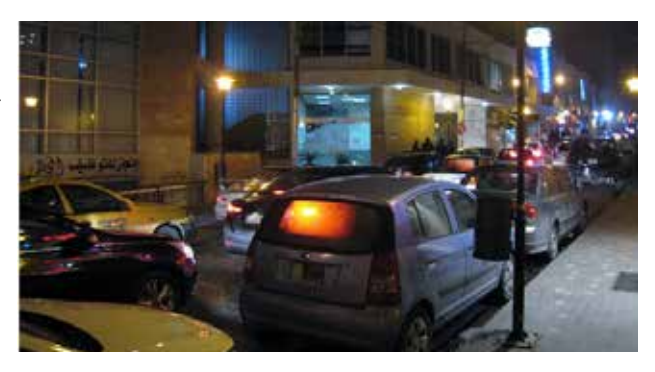
Figure 2: A line of cars at the beginning of Rainbow Street on a Friday night. Every evening, especially Thursday and Friday nights, cars filled with Ammanis drive down Rainbow Street.

The yellow taxi cabs, Harley Davidson motorcycles, pick-up trucks, small military buses, cars, and SUVs that come to the First Circle round-about at the beginning of Rainbow Street have two choices: loop around the circle and return to Al Koliya Al Eilmiyya Al Islamiyya Street, or enter the one-way, cobblestone street filled with vehicles slowly making their way through the street. <sup>46</sup> "I'll take you to First Circle bes (only), not Rainbow