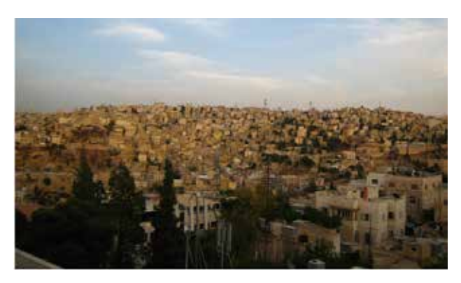
Figure 1: Amman is famous for its low-rise, limestone buildings.

increased from 4,000 in 1920 to 2.1 million in 2011 to 2.9 million in 2012. More recent migrants include Palestinian, Iraqi, Syrian, and Libyan refugees and Egyptian, South Asian, and Filipino migrant laborers. Because most inhabitants are recent migrants, they are not strongly affiliated with Amman, a trend noted by Daher. 16 Urban development projects demonstrate recent efforts to build a city identity for Amman. Certain projects—hotels, shopping centers, and business towers—emphasize Amman's role as an emerging global city. Heritage-based projects like Rainbow Street emphasize Amman's urban and social heritage in an attempt to link Amman—a relatively new city—to a firm past. Developers, inhabitants, and the municipality are trying to achieve a balance between highlighting Amman's heritage and supporting its current role as a capital city.